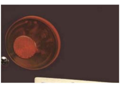
MODEL: EF24-TX ITEM CODE: 924-400-001 Dimension: 186 x 61 x 51 mm Weight: 280g (without batteries)