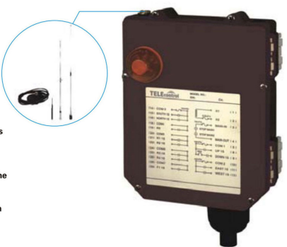
MODEL: EF24-RXC ITEM CODE: 924-100-103 Dimension: 210x162x107mm Weight: 1220g

Safety of Receiver Operation The system is with explosion-proof casing and inner electronic circuit safe solution and it meets ATEX rules and strictly complies with explosion-proof standard. The emergency stop circuit and control with duplex redundant and safety relay with forcibly guided (mechanically linked) contacts which make it meets the E-stop class Gat.3 in The European mechanical equipment standard. To ensure safety, continuous wireless communication device make receiver stop passively when the radio signal is disconnected or is interfered. Buttons can be programmed to interlock to avoid opposite operation.