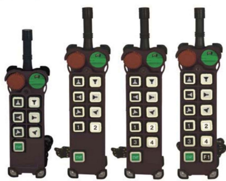
EF24-6S/D EF24-8S/D EF24-10S/D EF24-12S/D

MODEL: EF24-TX ITEM CODE: 924-400-001 Dimension: 186 x 61 x 51 mm Weight: 280g (without batteries)