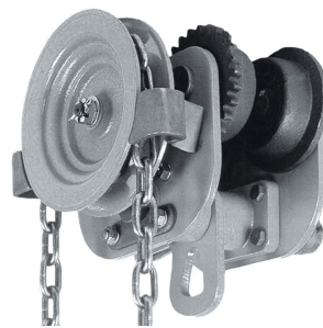
Referential Images Specifications may change without notice