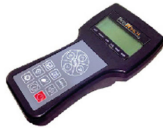
PWHY280 Control remoto simple con visor / Simple remote control with Display