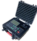
PWHY680 Control remoto con impresora y visor / Remote control with printer and display