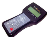
PWHY280 Control remoto simple con visor / Simple remote control with Display